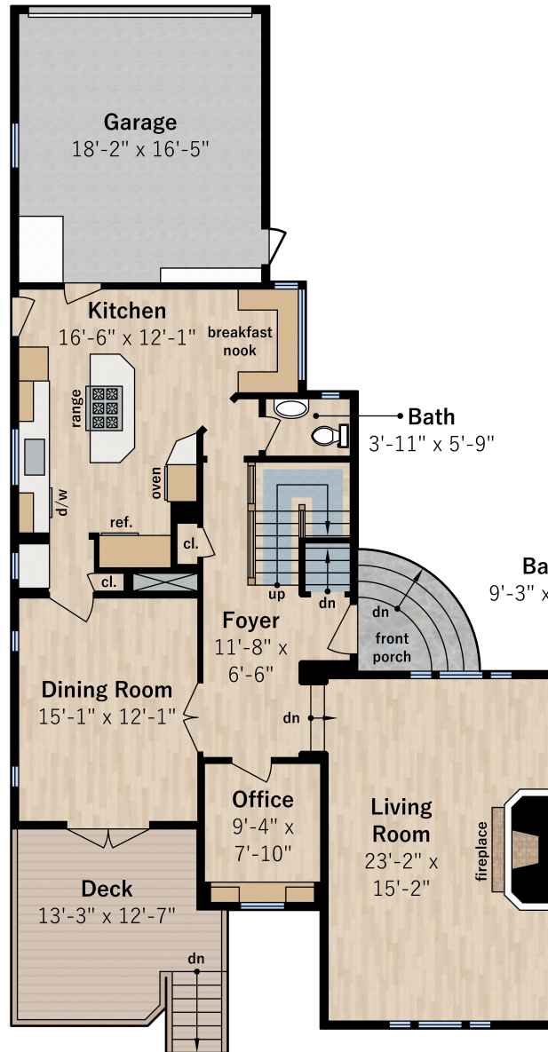
Main Level approx. 1,275 sqft